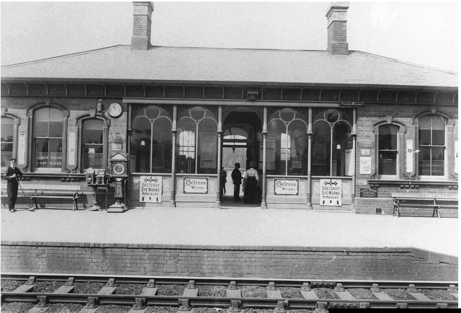
WHEN THE LAMPS WENT OUT