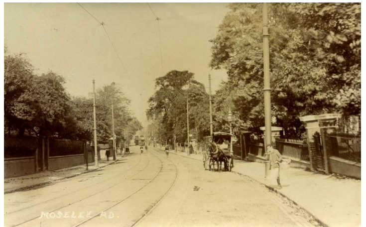
TOP LEFT: Brighton Road bridge TOP RIGHT: New Inn on Moseley Road BOTTOM LEFT: Congregational Church on Stoney Lane BOTTOM RIGHT: Moseley Road