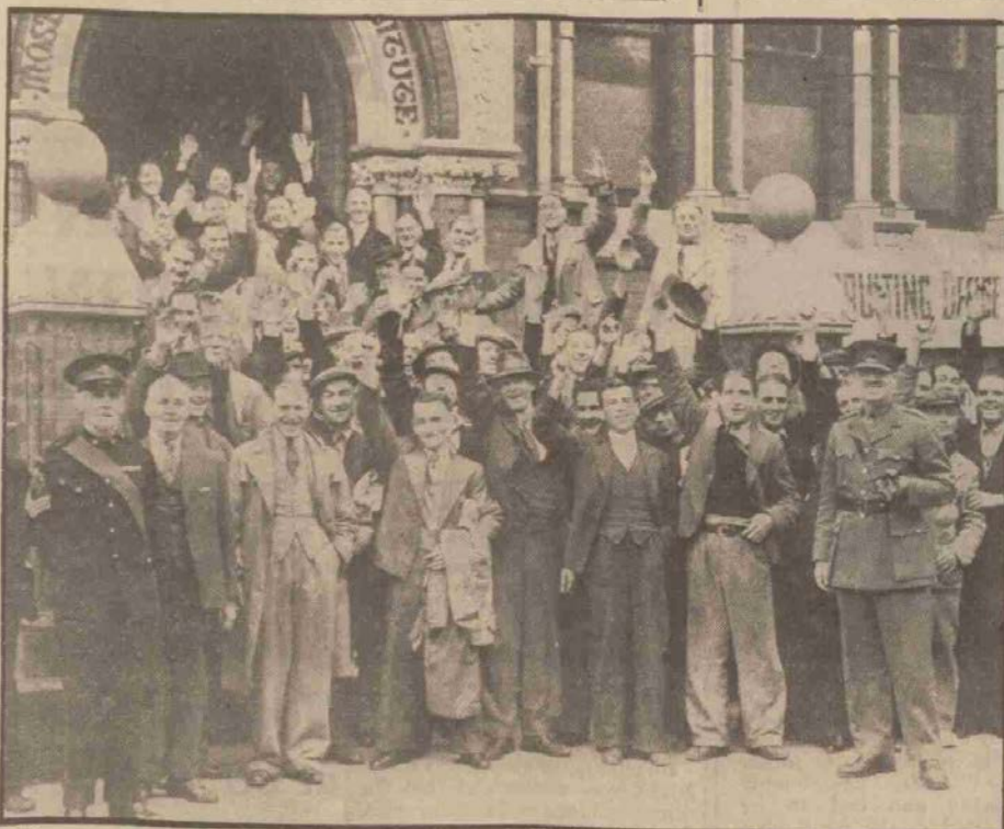
These recruits are in high spirits as they left Moseley and Balsall Heath Institute recruiting centre to-day before leaving Birmingham.