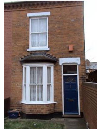
7 Noel Avenue