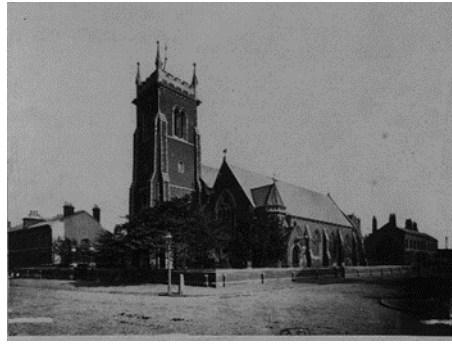
St Paul's Church