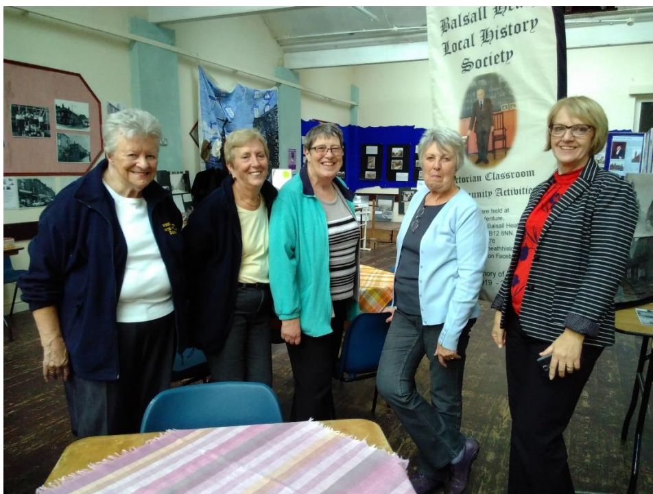
Balsall Heath Local History Society at Moseley Rd Art School October 2017