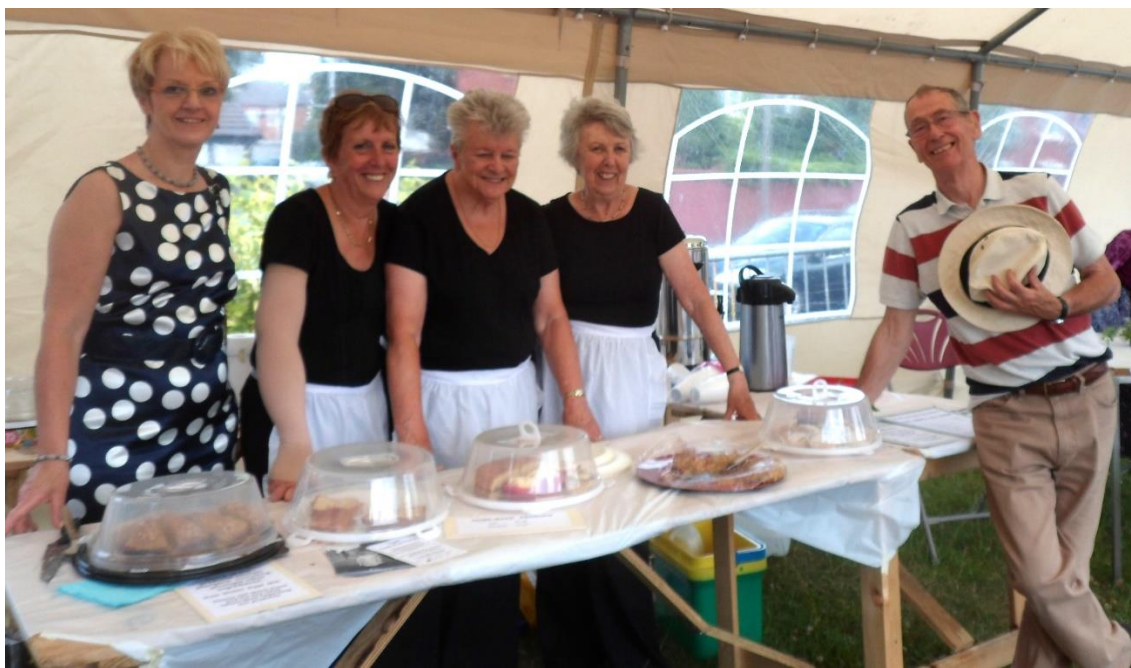
Balsall Heath Carnival – The Tea Tent July 4 th 2015