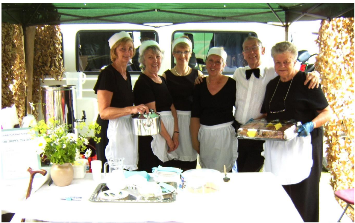
Balsall Heath Carnival – The Tea Tent July 2 nd 2011