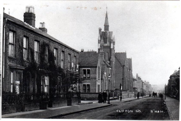
Clifton Road, c.1900

At the time the school opened there was a shortage of trained teachers and this issue was addressed by the Pupil Teacher scheme, a form of apprenticeship for young people, starting at age 13. They frequently faced an impossible task, having to take responsibility for large classes, with very little support or training.