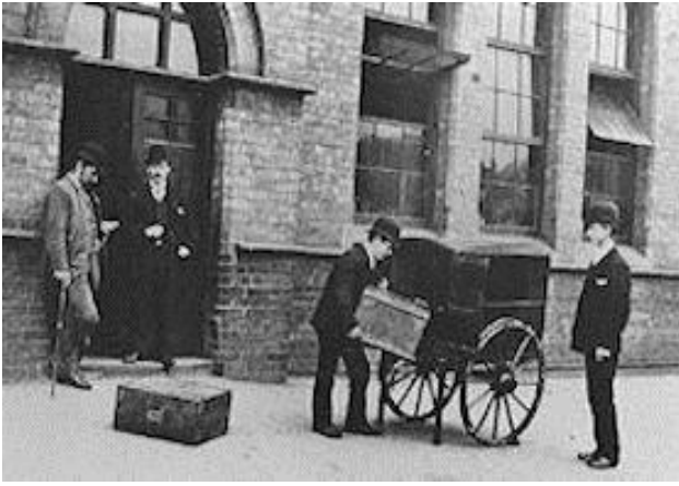
1900 Science Equipment being taken to schools.